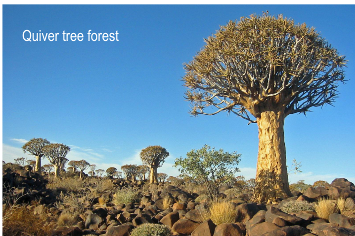
Quiver tree forest

Erosion of the overlying sediments widely exposed the two sills around Keetmanshoop. The dolerite sills and dykes display spheroidal weathering, typical of intrusive rocks, which led to the formation of rounded boulders of all sizes and shapes strewn over the hilly surface. One of the best places to see these works of the great sculptor Erosion is the Giant's Playground on Farm Gariganus some 25 km northeast of Keetmanshoop, which is also the site of the Quiver Tree Forest, which is one of Namibia's national monuments. This iconic tree, which has adapted to the arid climate by storing water under its rough bark, grows nine to ten metres tall and can attain an age in excess of 500 years. Its trunk and branches are easily hollowed out, and were made into quivers by the local Bushmen - a practice that gave the tree its popular name.