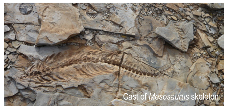
Cast of Mesosaurus skeleton

The 150 m thick lower sill intruded the glacial Dwyka sediments (> 300 million years), which originated when this part of Gondwana was situated near the south pole; the upper, ~120 m thick sill was emplaced within the overlying Ecce shales of a more temperate to subtropical period, as Gondwana moved towards equatorial regions. These mudstones formed in a huge inland sea surrounded by extensive conifer forests, which was home to the alligator-like reptile Mesosaurus tenuidens and extended across parts of modern Brasil and southern Africa. Thus Mesosaurus finds can be used to correlate rock strata across the two continents.